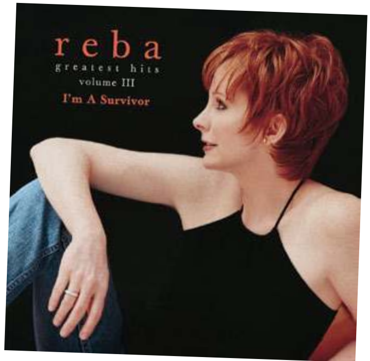
Cover of Reba's 2001 album Greatest Hits Vol. 3: I'm a Survivor .