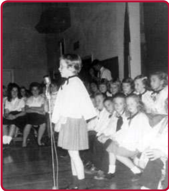
Reba making her public singing debut with "Away in a Manger" in first grade.

Begin by asking your students what they know about Reba McEntire. Once students have shared, read Reba's biography (see back page) to the class or pass out copies for the students to read themselves. Then, select the activities that best correspond to your subject area.