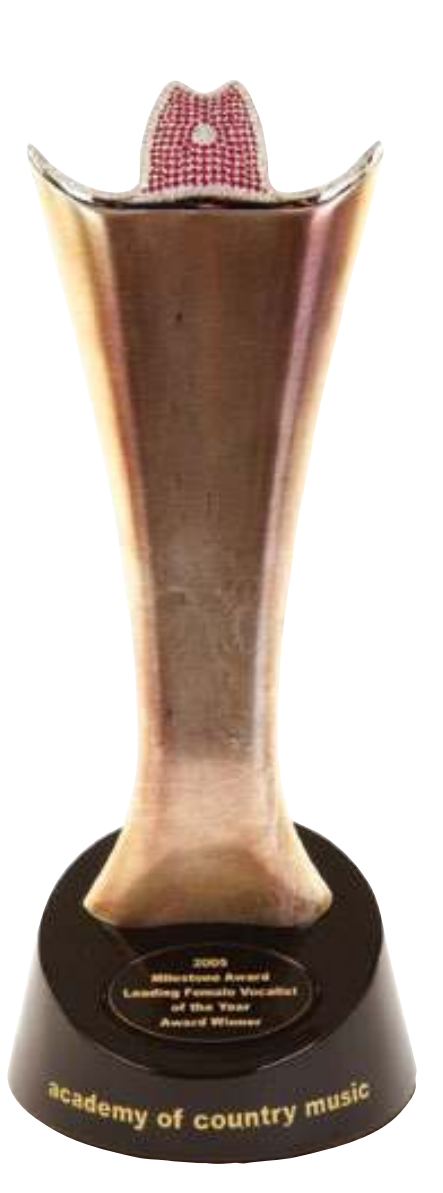
ACM Milestone Award, given to Reba in 2005 in recognition of being named Top Female Vocalist a record seven times.