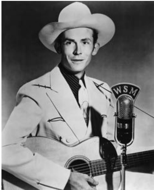
Written and Performed by Hank Williams