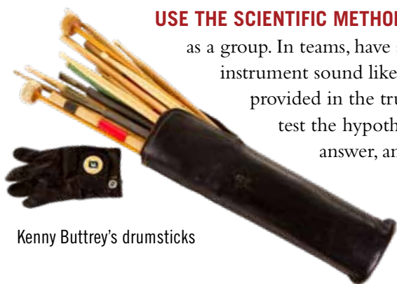
Kenny Buttrey's drumsticks

USE THE SCIENTIFIC METHOD to allow students to study an instrument as a group. In teams, have students ask a question (ex. what will the instrument sound like), research the question based on information provided in the trunk and what you observe, form a hypothesis, test the hypothesis by playing the instrument, analyze the answer, and communicate the results to the class.