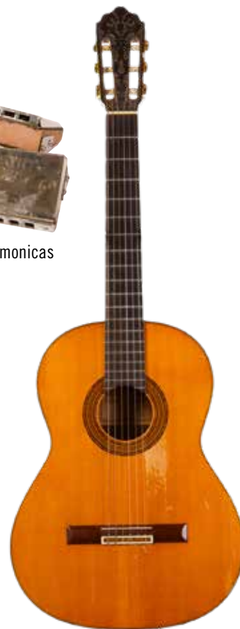
Fred Carter Jr.'s guitar

PLAY the instrument assigned to each group for the whole class to compare and contrast results of all groups.