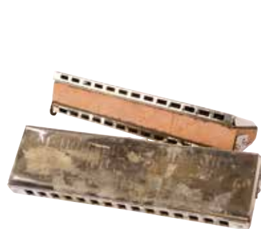
Charlie McCoy's harmonicas

LEARN about the important instruments in country music history (fiddle, banjo, guitar, mandolin) as well as instruments that were used by the Nashville Cats in the 1960s and early 1970s (wah-wah pedal, harmonica, lap steel guitar).