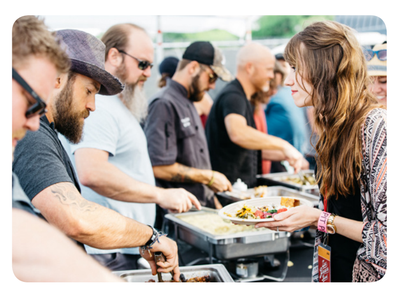
The Zac Brown Band serves guests at an Eat & Greet; July 7, 2015; Bangor, Maine.