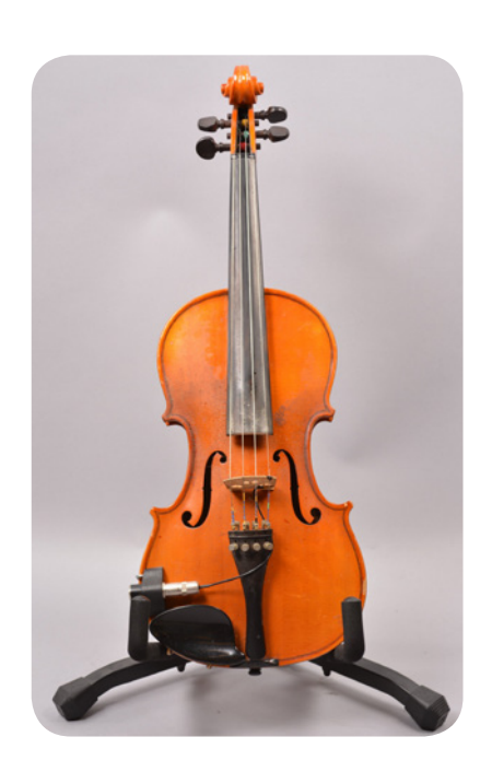
Knilling Bucharest model 4/4 violin, owned by Jimmy De Martini.