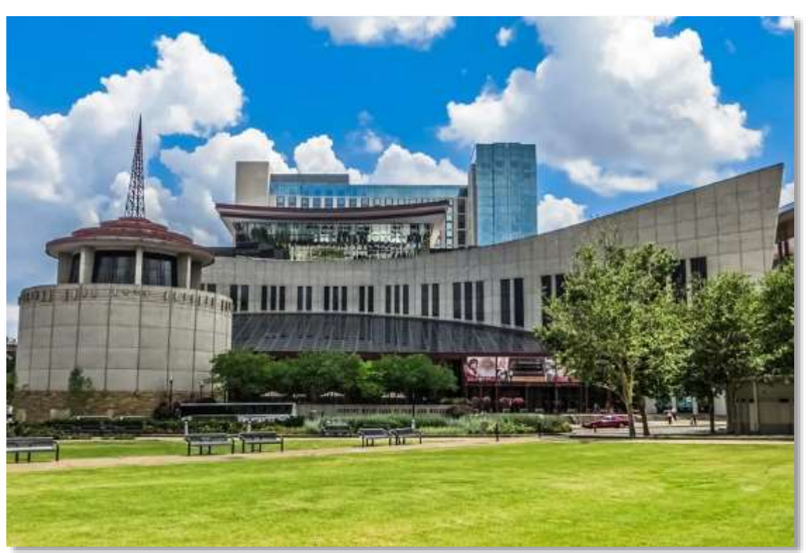
Country Music Hall of Fame and Museum downtown Nashville, Tennessee