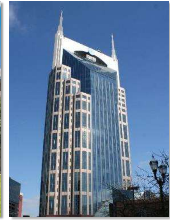
AT&T building downtown Nashville, Tennessee